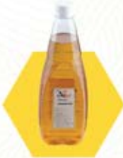
Sticky Jar 250g,500g,1kg