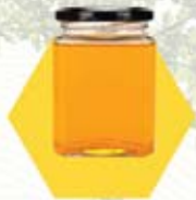
Square Jar 250g,500g,1kg