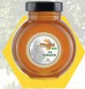
Round Jar 250g,500g,1kg