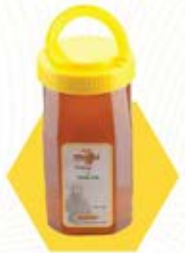
Pet Jar 250g,500g,1kg