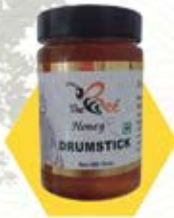
Cylinder Jar 250g,500g,1kg